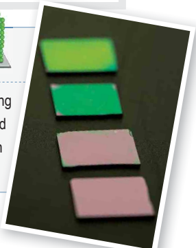
The CPBs of various thicknesses on the surface show different colors, depending on the CPB thickness.

The CPB of special interfacial functions was first fabricated using precise polymerization allowing uniform growth of polymers, and hence accurate control of the brush structure and increased density. This research successfully created a micrometer-sized CPB ten times thicker than conventional ones, drastically reducing its friction resistance.